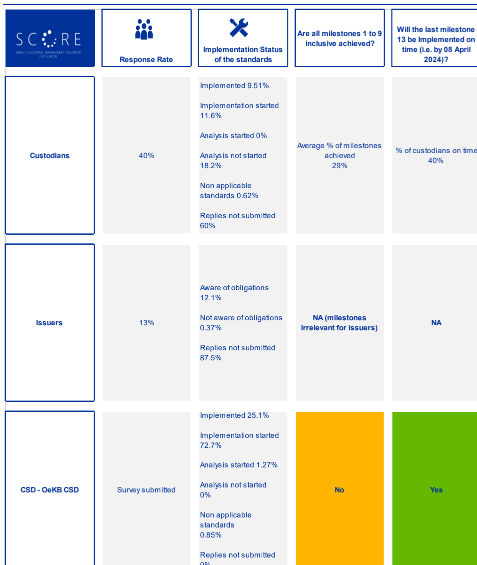
Figure 1 Summary of the monitoring exercise