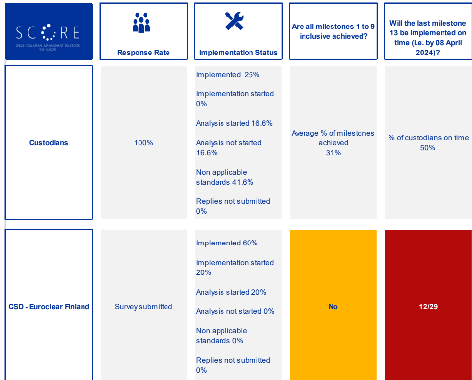
Figure 1 Summary of the monitoring exercise

The preparations of the Finnish market have been impacted by Euroclear Finland’s updated Adaptation Plan as well as its set T2S migration date in September 2023. Given the work on T2S migration as well as difficulties in meeting the billing requirements in a direct holding market, this puts timely compliance with the standards at risk and, thus, the Finnish market can be considered behind schedule overall. The Finnish NSG will follow-up on this matter in view of achieving full clarity as soon as possible.